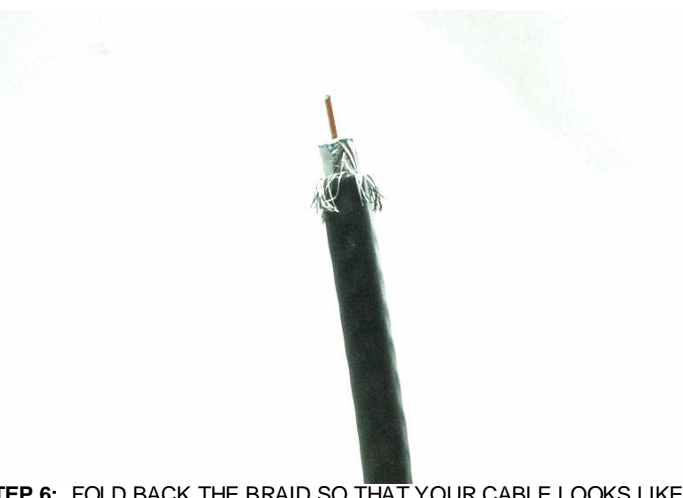
STEP 6: FOLD BACK THE BRAID SO THAT YOUR CABLE LOOKS LIKE THE ONE PICTURED ABOVE. YOU ARE NOW READY TO INSTALL YOUR CONNECTOR.