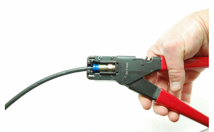
STEP 9: INSERT THE COMPRESSION CONNECTOR INTO THE COMPRESSION TOOL AS SHOWN SO THAT THE CONNECTOR IS SQUARE WITH THE MOUTH OF THE TOOL.