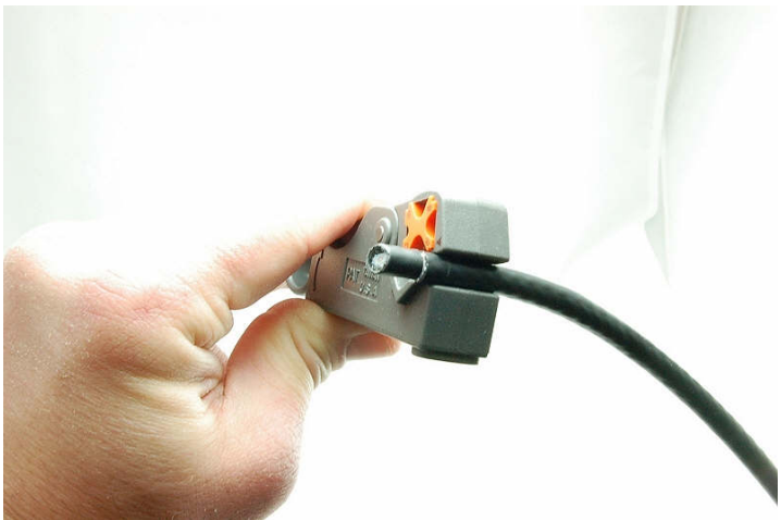
STEP 4: REMOVE THE CABLE FROM THE STRIPPER. BLADE DEPTHS CAN BE ADJUSTED WITH THE ALLEN SCREWS ON THE BOTTOM OF THE UNIT.

STEP 1: SET THE ORANGE V-BLOCK TO THE PROPER WIRE SIZE BY REMOVING IT, AND RE-INSTALLING IT WITH THE CORRECT SIZE.