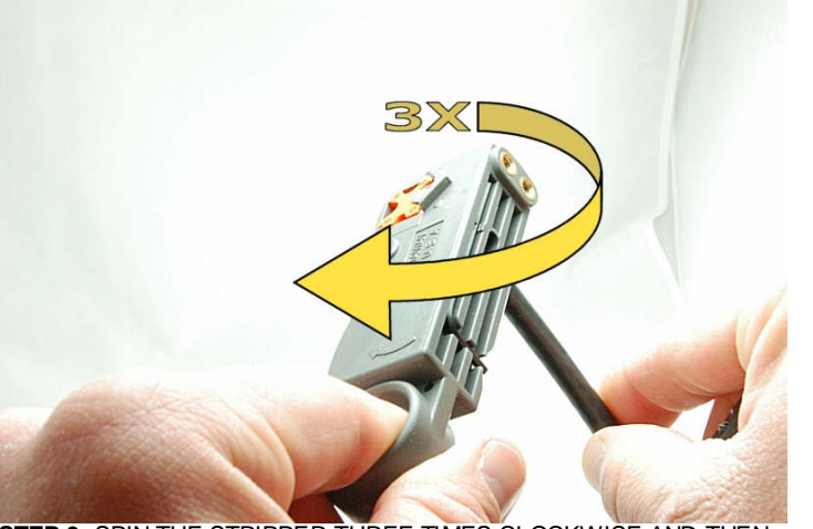
STEP 3: SPIN THE STRIPPER THREE TIMES CLOCKWISE AND THEN THREE TIMES COUNTER-CLOCKWISE.