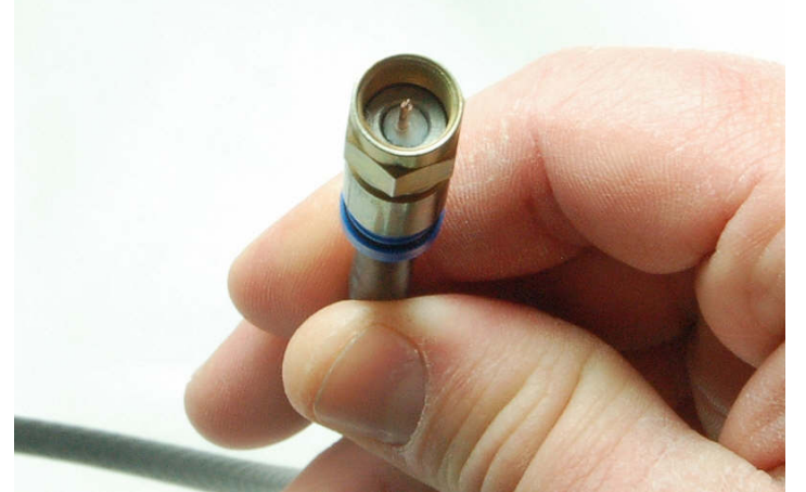
STEP 8: INSTALL THE CONNECTOR SO THAT THE CABLES WHITE DI-ELECTRIC COMES FLUSH WITH THE BOTTOM OF THE THREADS. THE INSTALLED FITTING SHOULD LOOK LIKE THE ONE SHOWN ABOVE.