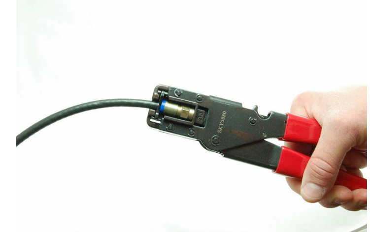
STEP 10: SQUEEZE THE COMPRESSION TOOL UNTIL THE RATCHETING HANDLES RELEASE.