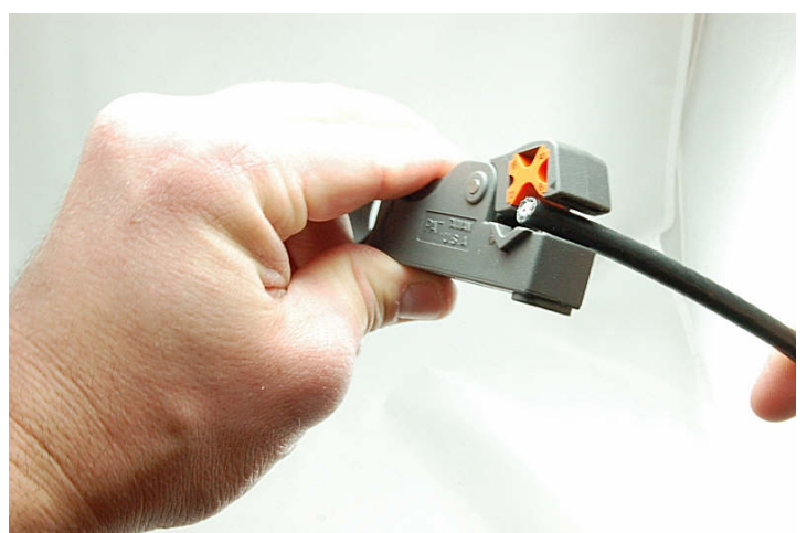
STEP 1: SET THE ORANGE V-BLOCK TO THE PROPER WIRE SIZE BY REMOVING IT, AND RE-INSTALLING IT WITH THE CORRECT SIZE.