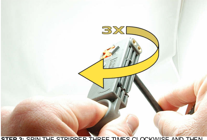
STEP 3: SPIN THE STRIPPER THREE TIMES CLOCKWISE AND THEN THREE TIMES COUNTER-CLOCKWISE.