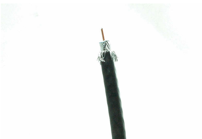
STEP 6: FOLD BACK THE BRAID SO THAT YOUR CABLE LOOKS LIKE THE ONE PICTURED ABOVE. YOU ARE NOW READY TO INSTALL YOUR CONNECTOR.