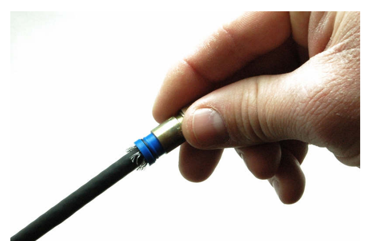
STEP 7: INSTALL COMPRESSION CONNECTOR ONTO THE PREPARED CABLE END.