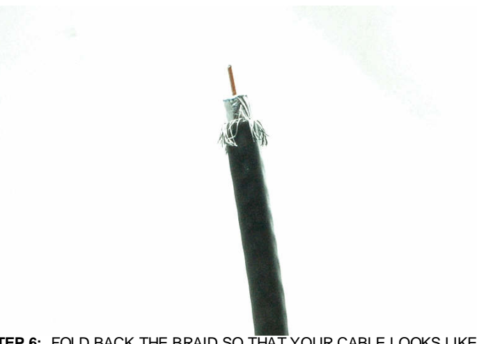
STEP 6: FOLD BACK THE BRAID SO THAT YOUR CABLE LOOKS LIKE THE ONE PICTURED ABOVE. YOU ARE NOW READY TO INSTALL YOUR CONNECTOR.