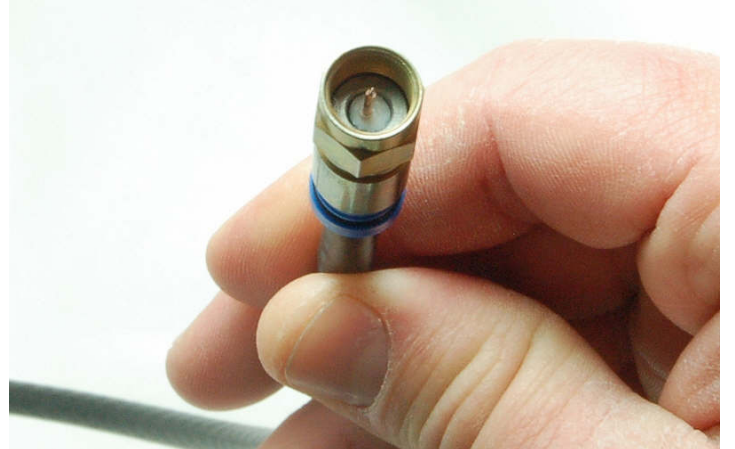
STEP 8: INSTALL THE CONNECTOR SO THAT THE CABLES WHITE DI-ELECTRIC COMES FLUSH WITH THE BOTTOM OF THE THREADS. THE INSTALLED FITTING SHOULD LOOK LIKE THE ONE SHOWN ABOVE.