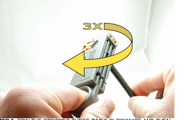
STEP 3: SPIN THE STRIPPER THREE TIMES CLOCKWISE AND THEN THREE TIMES COUNTER-CLOCKWISE.