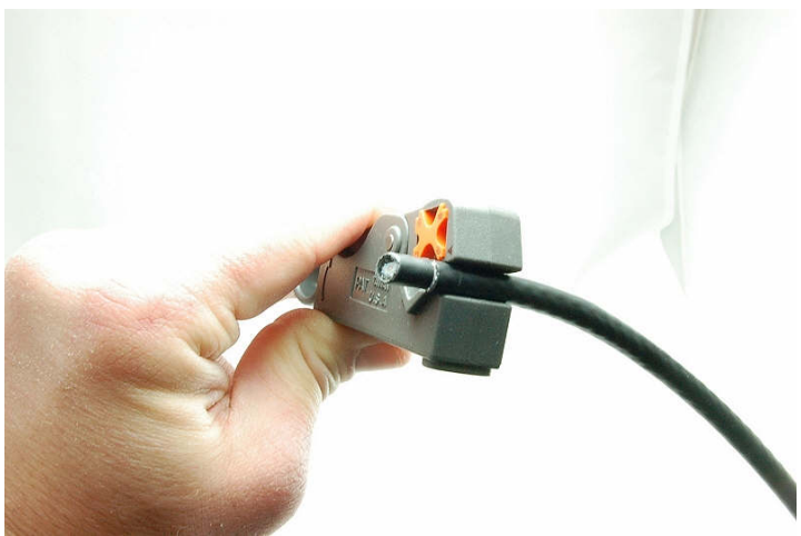
STEP 4: REMOVE THE CABLE FROM THE STRIPPER. BLADE DEPTHS CAN BE ADJUSTED WITH THE ALLEN SCREWS ON THE BOTTOM OF THE UNIT.

STEP 1: SET THE ORANGE V-BLOCK TO THE PROPER WIRE SIZE BY REMOVING IT, AND RE-INSTALLING IT WITH THE CORRECT SIZE.