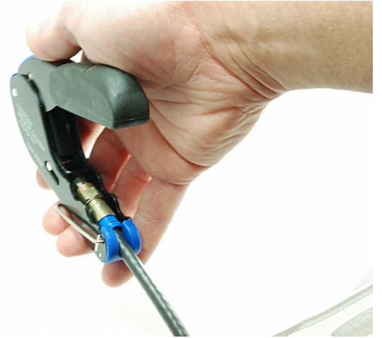
STEP 9: INSERT THE COMPRESSION CONNECTOR INTO THE COMPRESSION TOOL AS SHOWN SO THAT THE CONNECTOR IS SQUARE WITH THE MOUTH OF THE TOOL.