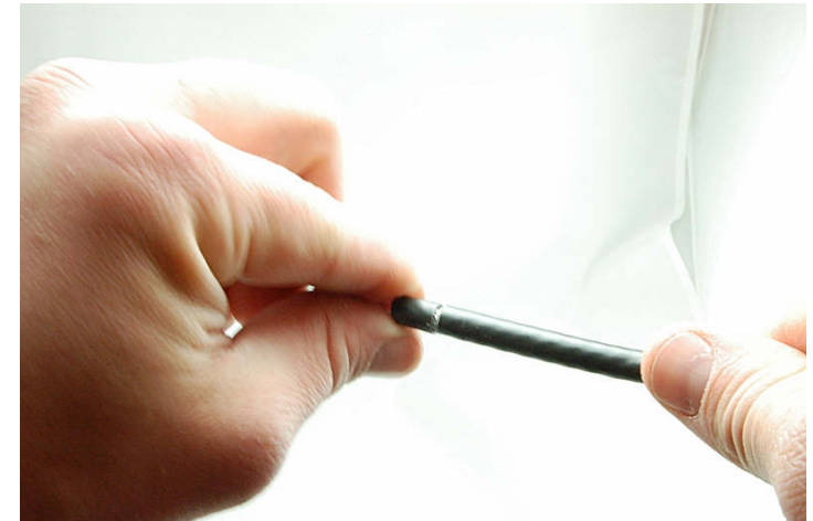
STEP 5: IT IS RECOMMENDED YOU PULL OFF THE COAXIAL CABLE REMNANTS WITH YOUR FINGERS TO EXTEND THE LIFE OF YOUR STRIPPER BLADES.