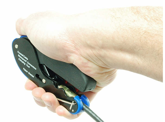
STEP 10: SQUEEZE THE COMPRESSION TOOL UNTIL THE RATCHETING HANDLES RELEASE.